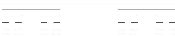
Figure 1.1: Construction of the ternary Cantor set

The ternary Cantor set C is self-similar. Indeed, it contains copies of itself at many different scales. Moreover, C is an uncountable compact set with zero Lebesgue measure. The Hausdorff dimension of the Cantor set C is s = \log_3 2 and \mathcal{H}^s(C) = 1 ([10, Theorem 1.14]).